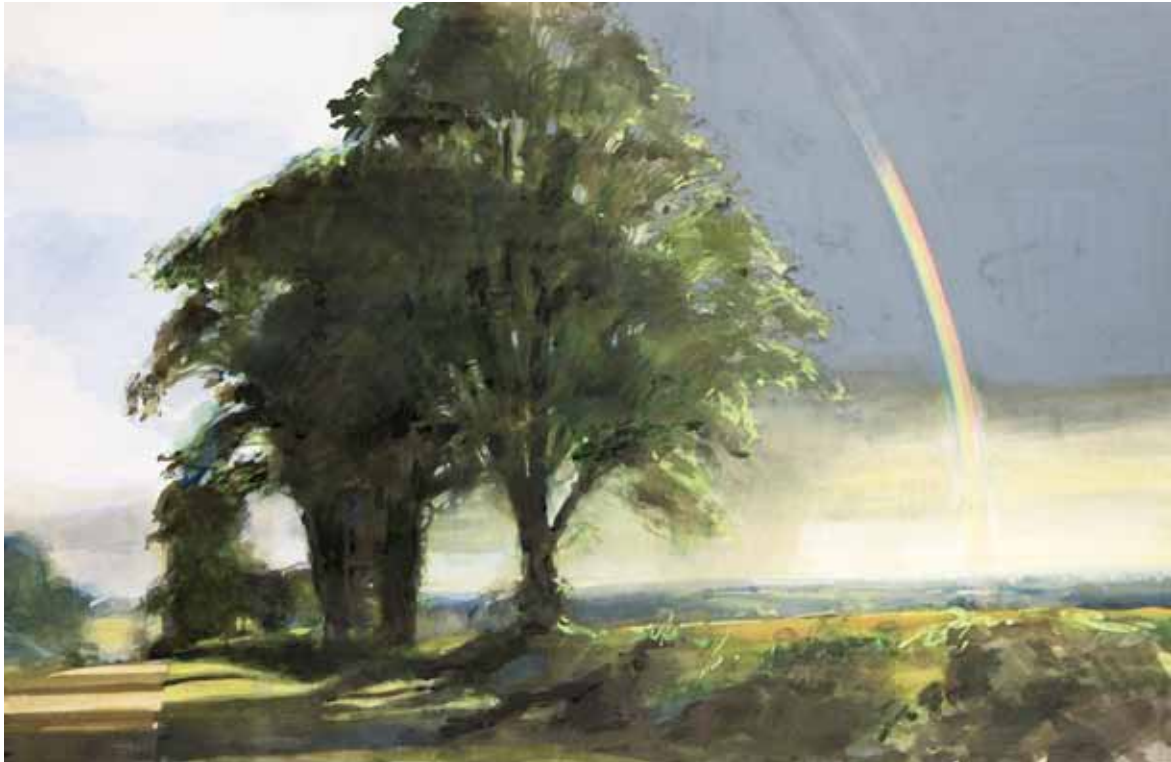
Lane, Trees and Rainbow Watercolour & body colour, and pastel, 23¼ x 35¾ in