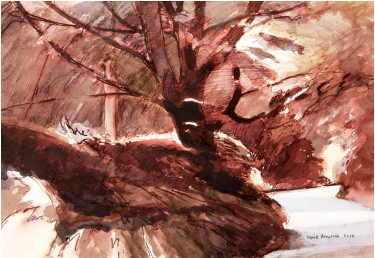
Worcestershire Lane Sketch II - 2010 Pen and ink wash, 13¾ x 19¾ in