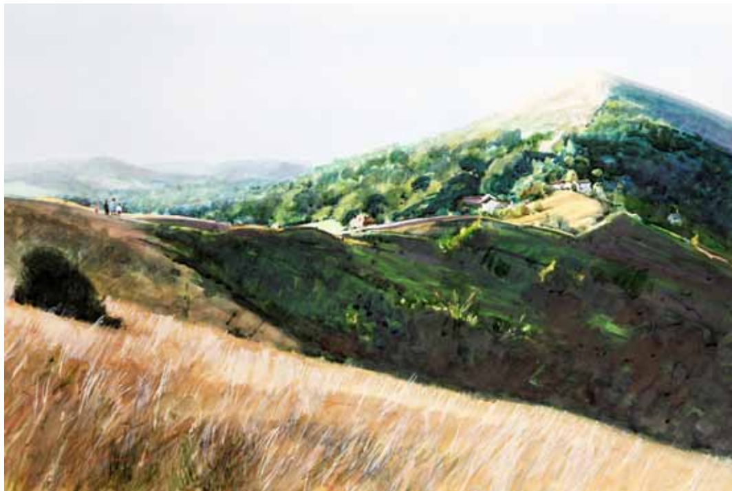
Walking Family, Malvern Hills II - 1993 Watercolour and body colour, 23½ x 35¼ in