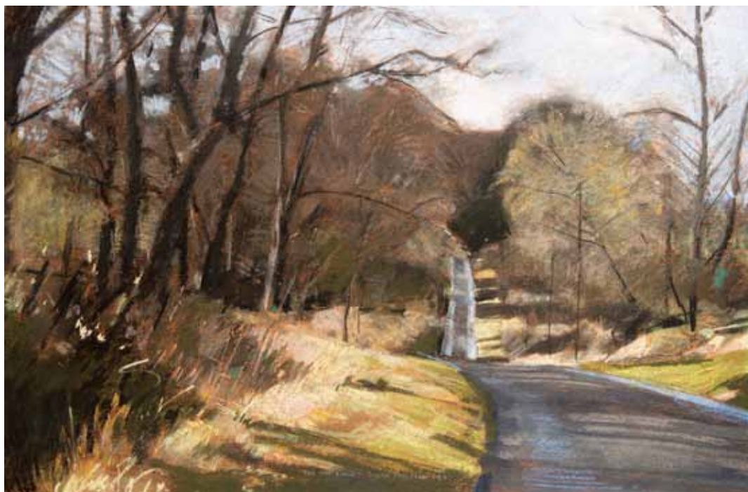
The Wet Lane, Malverns - 1987 Pastel, 23¼ x 35¾ in