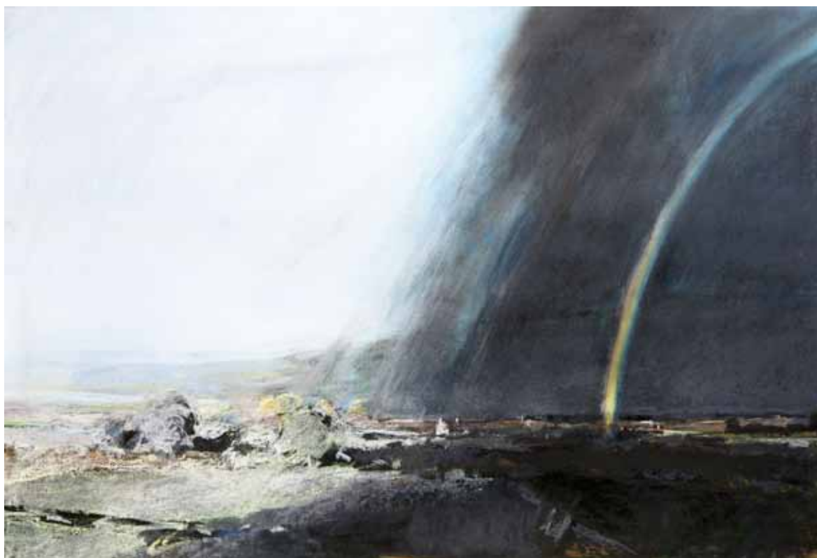
Landscape with Rainbow Pastel, 23½ x 35 in