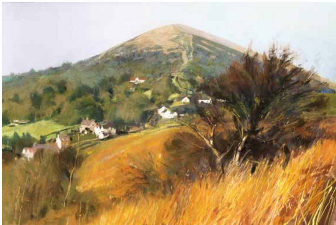
Trees and Wild Grasses, Malverns - 1993 Pastel, 23½ x 35¼ in