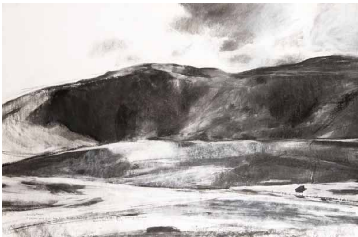
Arenig Fawr Y Castell and Gelli Deg from Ffridd Y Fawnog - 1987 Charcoal and body colour, 23¼ x 35¾ in