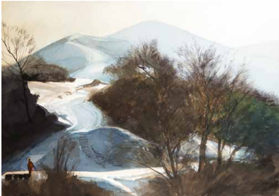
Single Walker, Snow and Trees, Malvern Hills Watercolour, 23½ x 34 in