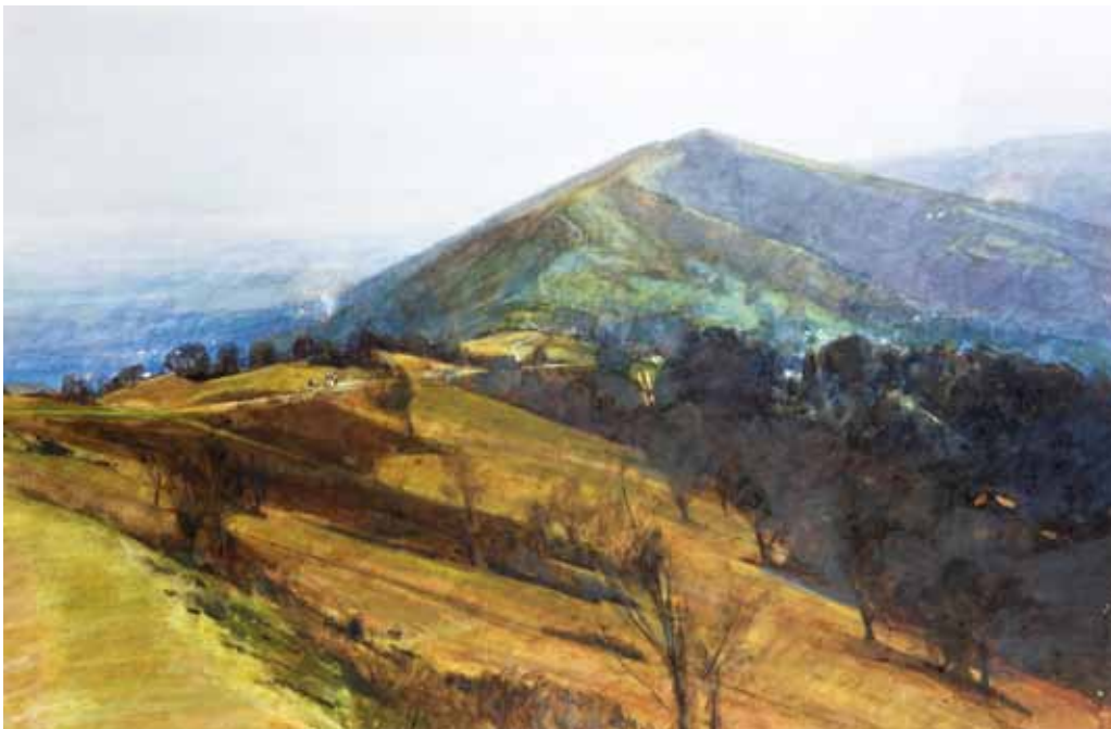
Walking Family, Malvern Hills I Watercolour, 23½ x 35¾ in