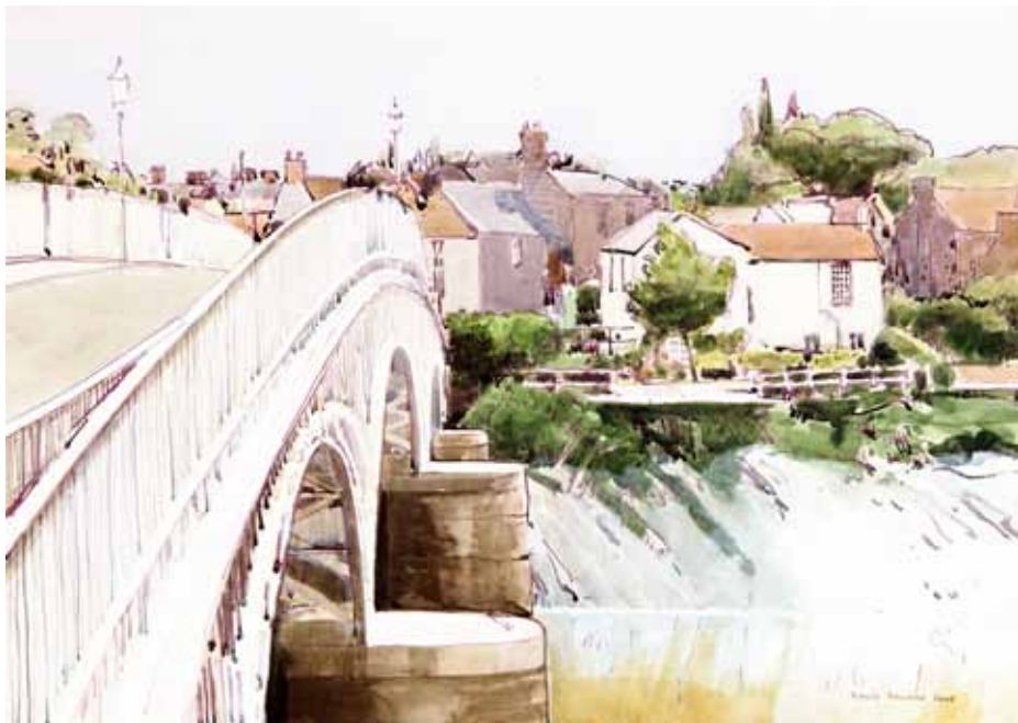
Iron Bridge, Bewdley - 2005 Ink and watercolour, 14 x 19½ in