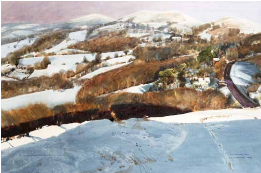
Malvern Hills, the Western Slopes under Snow - 1992 Watercolour and gouache, 21¼ x 35¼ in