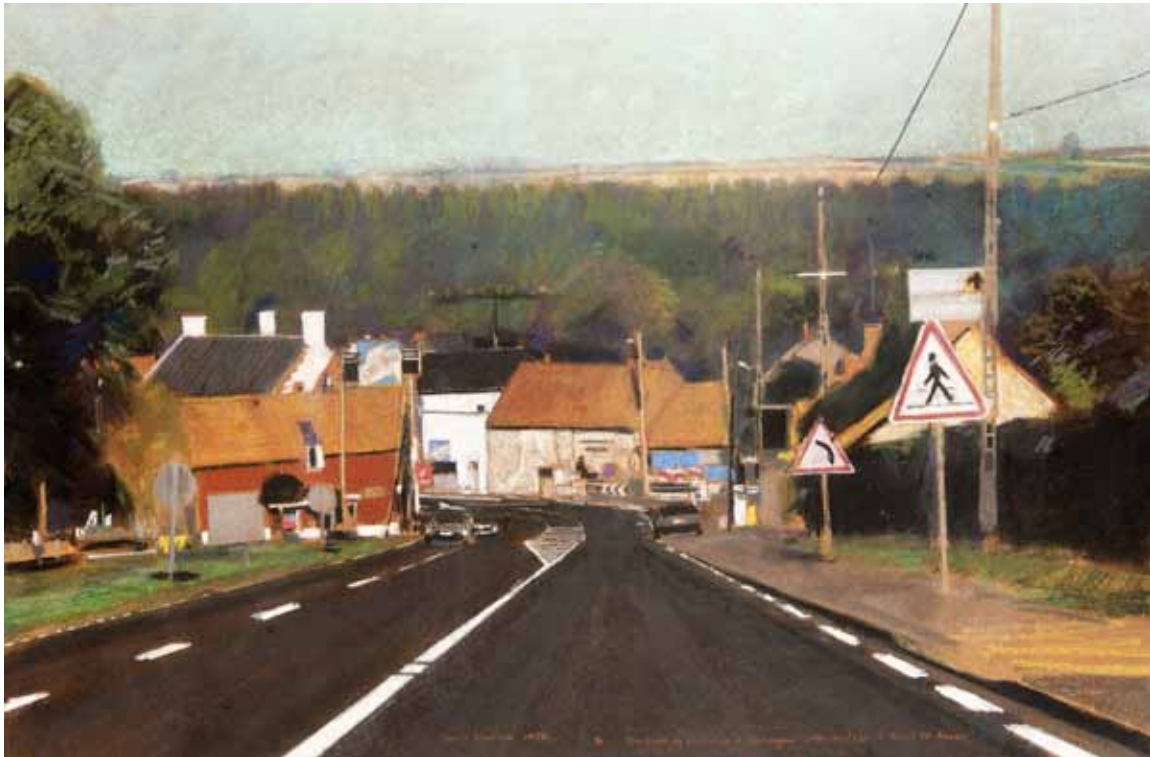
The Road to Calais and Boulogne II Pastel, 23½ x 35½ in