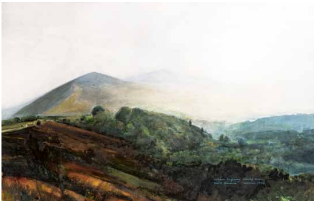
Malvern Ridgeway, Looking South - Autumn 1987 Watercolour and pastel, 23½ x 36¼ in