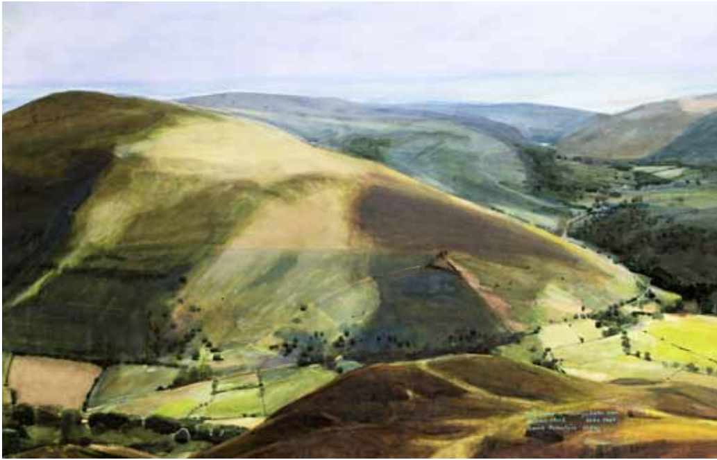
The road to Machynlleth from Cadar Idris, 2000 ft - 1987 Watercolour, 23¼ x 35 in