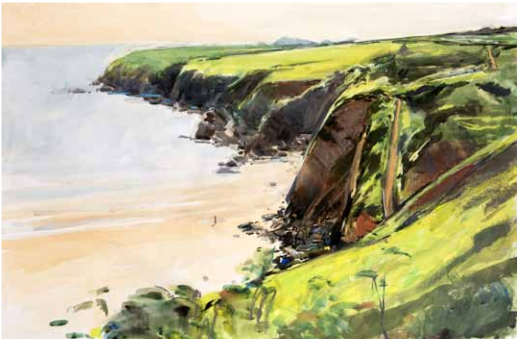
St Davids, South Wales - 1982 Watercolour and gouache, 23¼ x 35¼ in