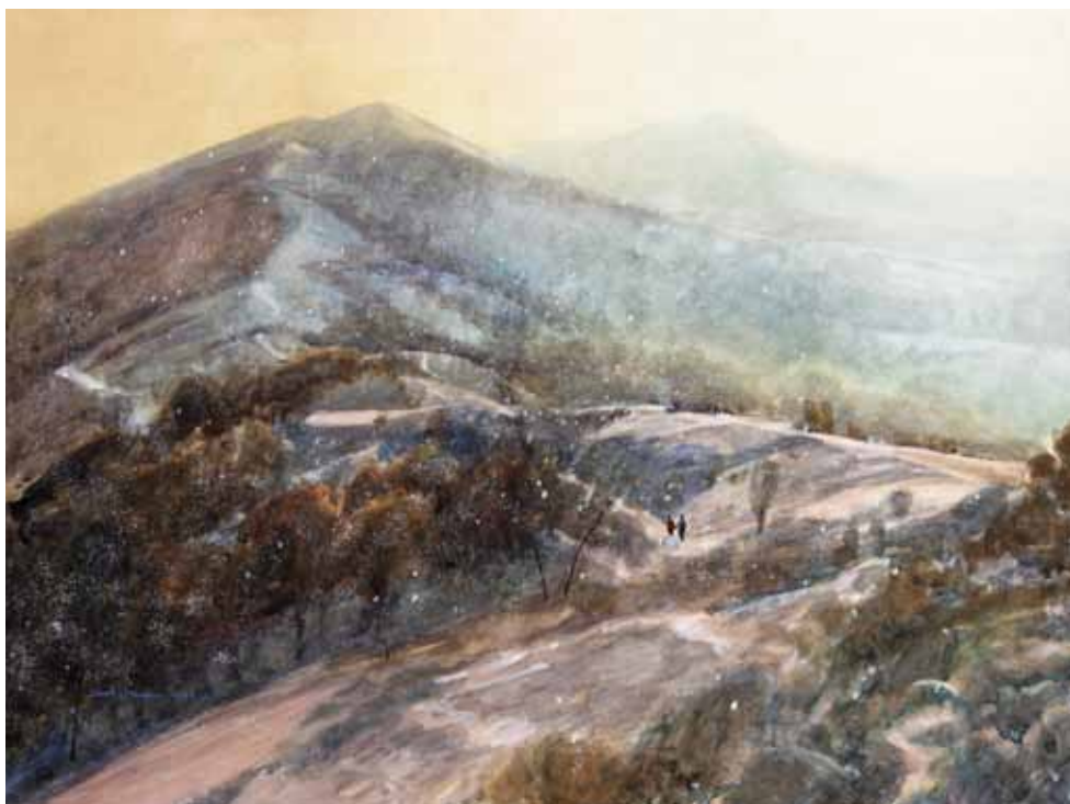
Falling Snow, Malvern Hills, 1993 Watercolour and gouache, 23½ x 35¼ in