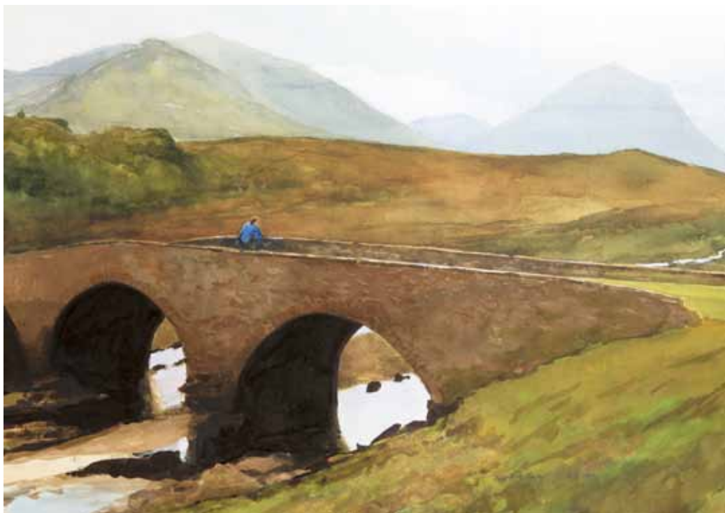
Sligachan Bridge, Isle of Skye - 2012 Watercolour, 23½ x 33¾ in