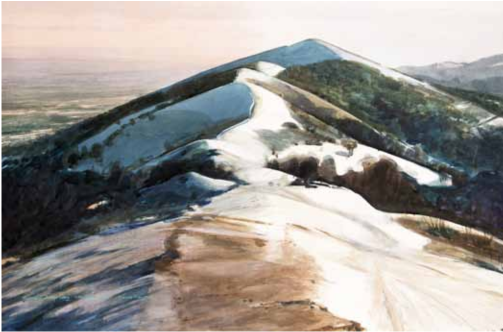
Malvern Ridgeway - January 1988 Watercolour and gouache, 23¼ x 36¼ in