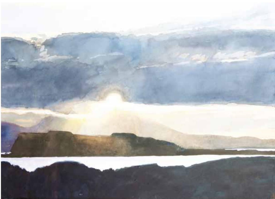
Isle of Skye, Sunset Watercolour, 24 x 34 in