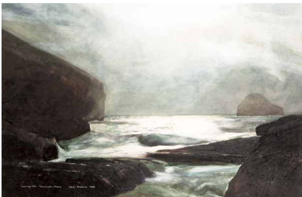
Incoming Tide, Trebarwith Strand - 1988 Watercolour, 23¼ x 35¾ in