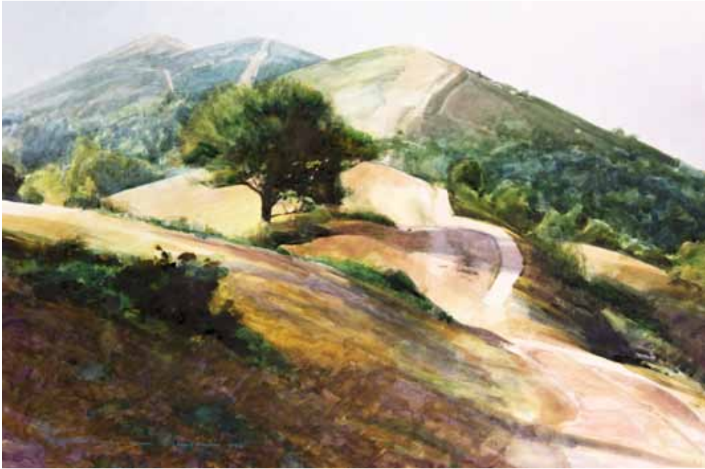
The Path below Black Hill, Malvern - 1992 Watercolour, 23½ x 35¾ in