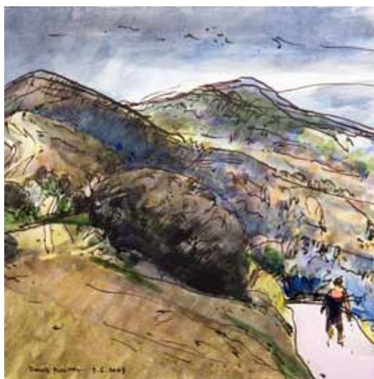
Malvern Hill Sketch I - 09.05.2008 Reed pen and wash, 10¼ x 10¼ in