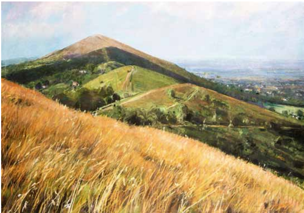
Summer Grass, Malvern Hills I - 1991 Pastel, 23½ x 36¼ in