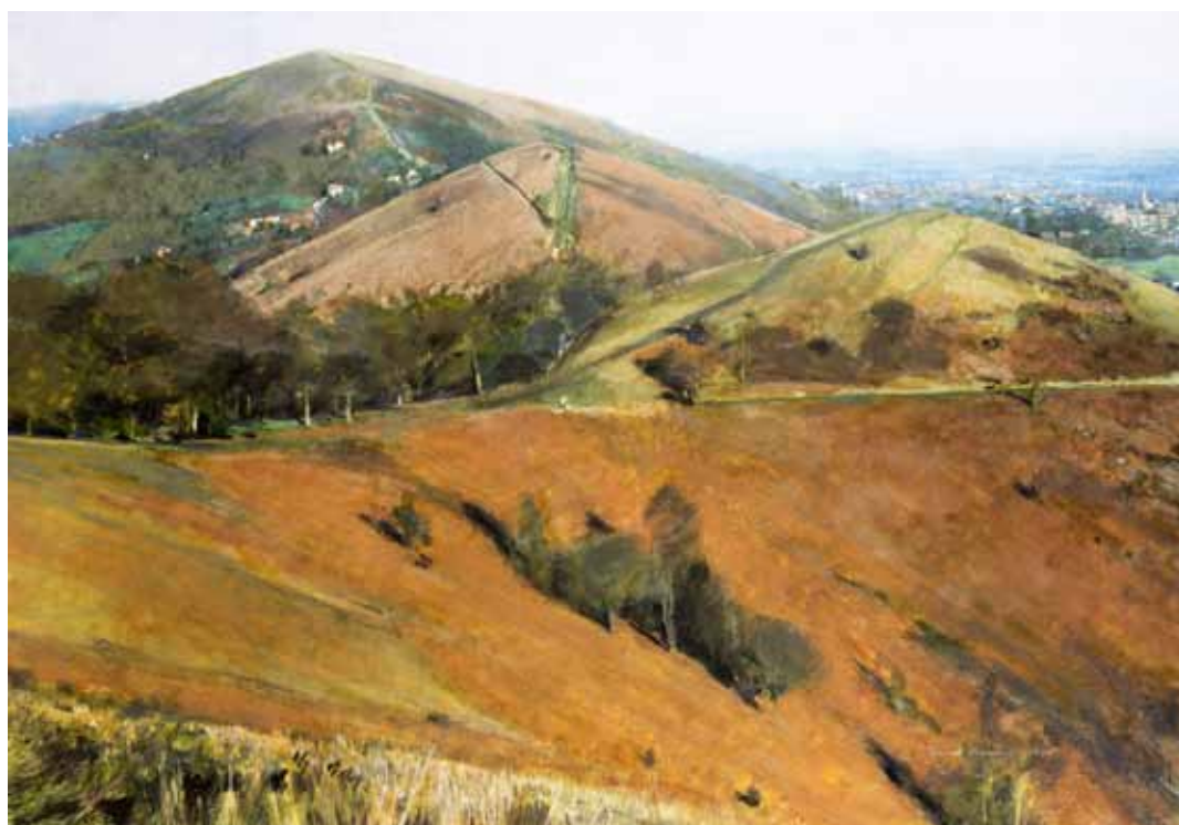
Walkers near the Heathland, Malverns Pastel, 23½ x 35¼ in