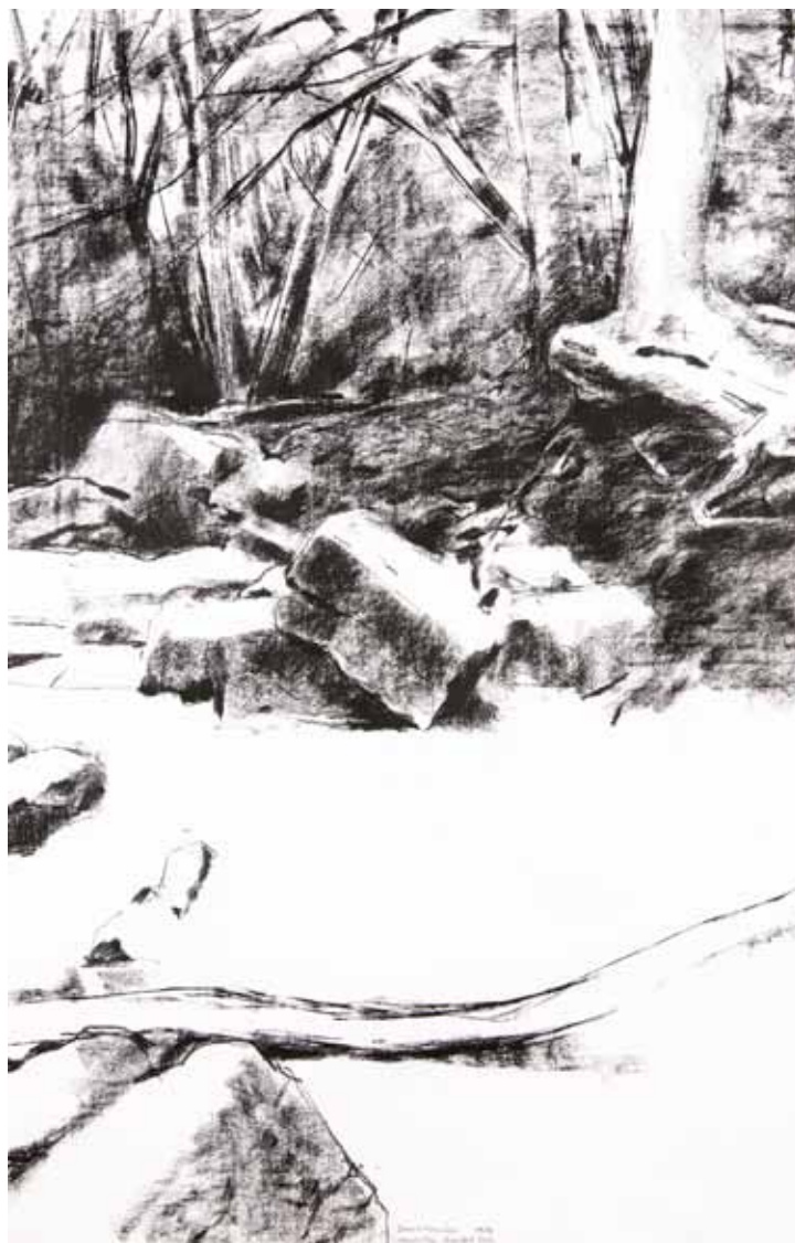
Janet's Foss, Gordale Scar - 1984 Charcoal, 3 ¼ x 23¼ in