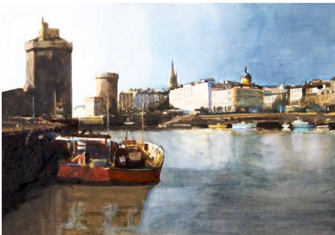
La Rochelle - 2009 Watercolour and body colour, 14 x 19½ in