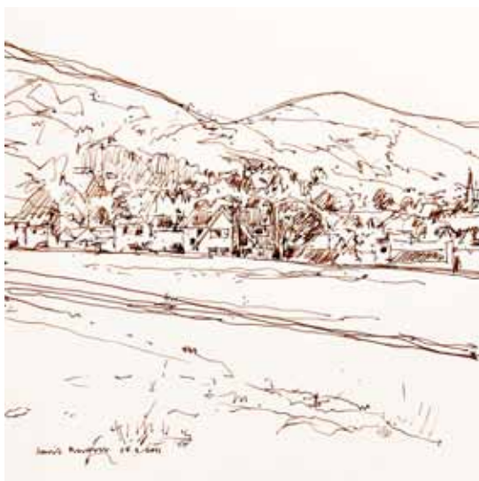
Malvern Common I - 28.02.2011 Pen and ink, 10½ x 10½ in