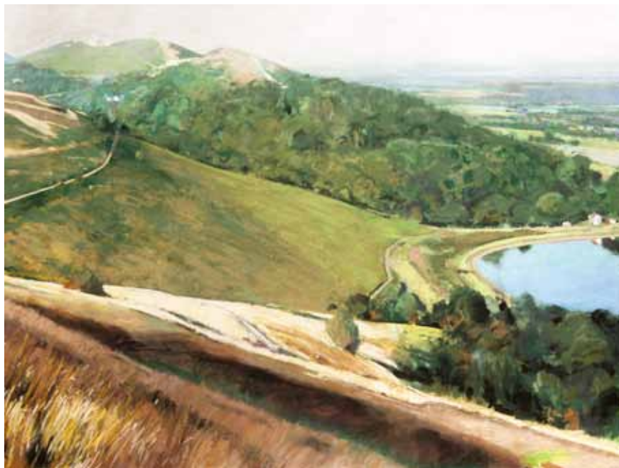
British Camp Reservoir - 1993 Pastel, 23½ x 31½ in