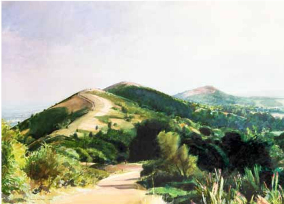
Single Walker, Malvern Hills, High Summer - 1993 Watercolour, 23½ x 35¼ in