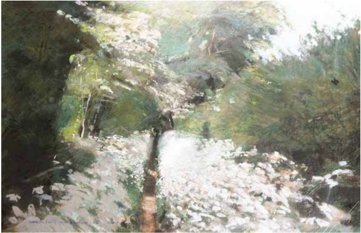
Footpath from Stow to Broadwell, Gloucestershire - 1987 Pastel, 22¾ x 35¾ in