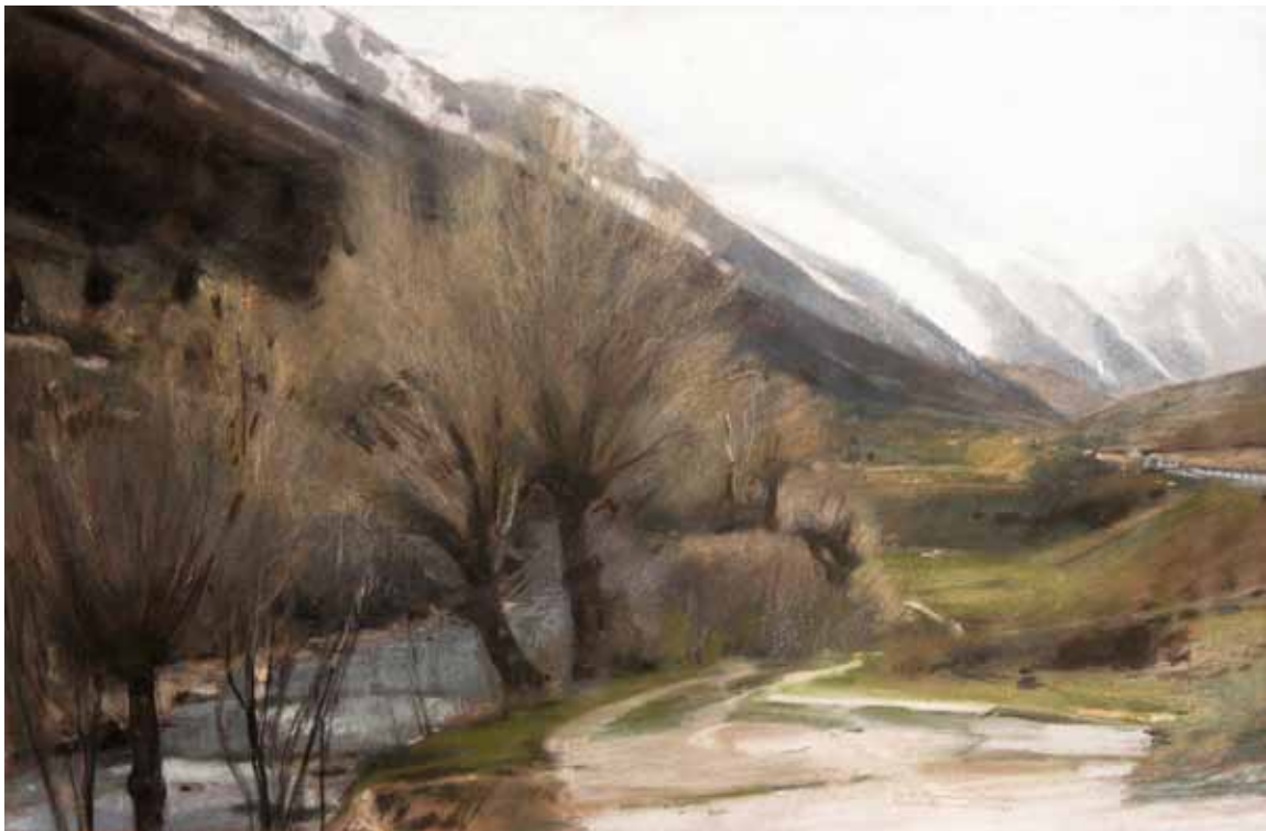
Col de Puymorens, Pyrenees Pastel, 23¼ x 35¾ in