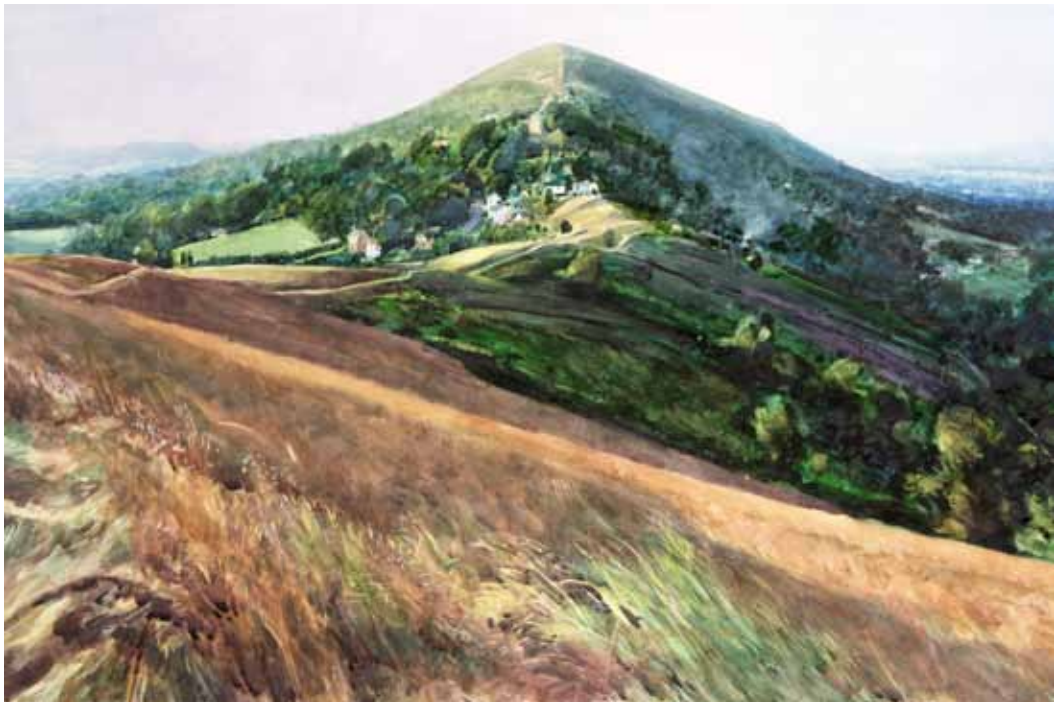
Bonfire, Wych and Beacon - 1991 Watercolour, 23½ x 35¼ in