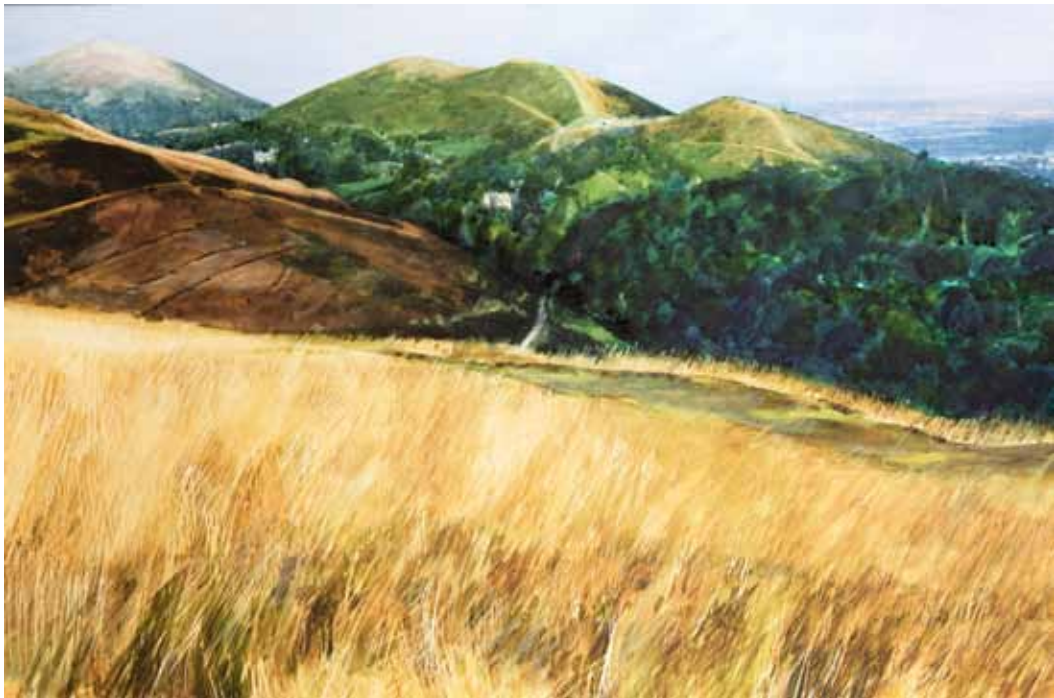
Worcester Beacon and the Wells Hills, Malvern - 1992 Watercolour and body colour, 23½ x 36¼ in