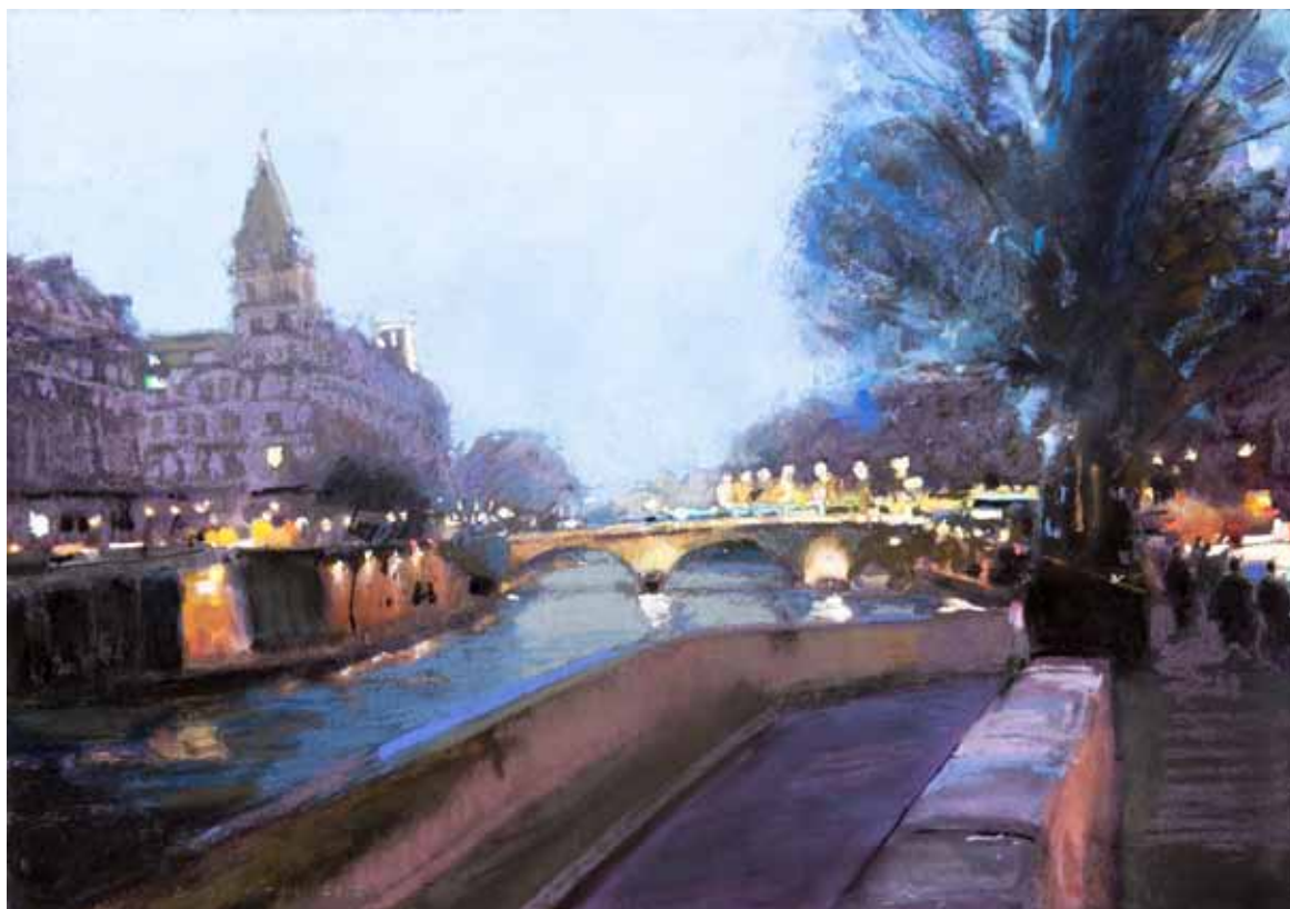
Banks of the Seine, Paris - 2003 Pastel, 14 x 19½ in