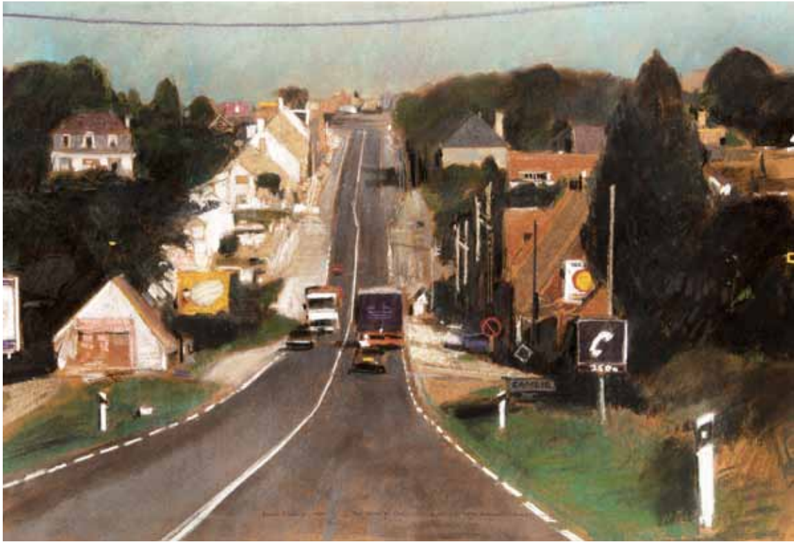
The Road to Calais and Boulogne I Pastel, 23½ x 35½ in