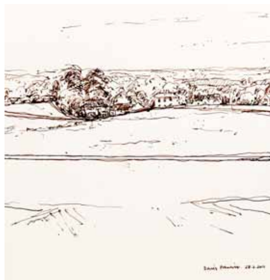
Malvern Common II - 28.02.2011 Pen and ink, 10½ x 10½ in