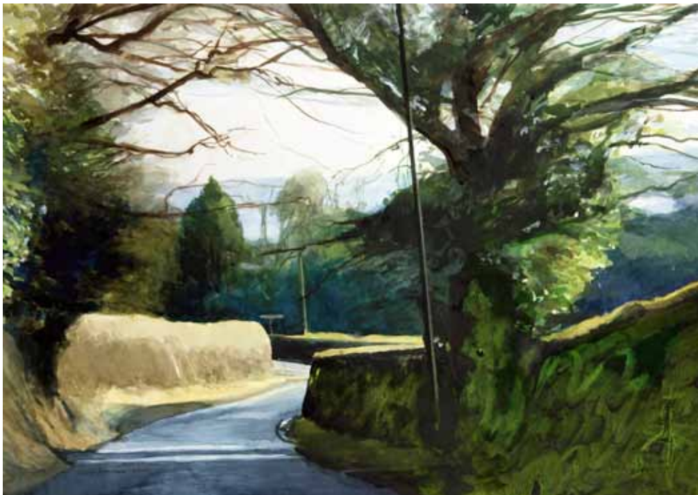
A Lane on the Worcestershire/Herefordshire Border - 2010 Watercolour, 23½ x 33¾ in