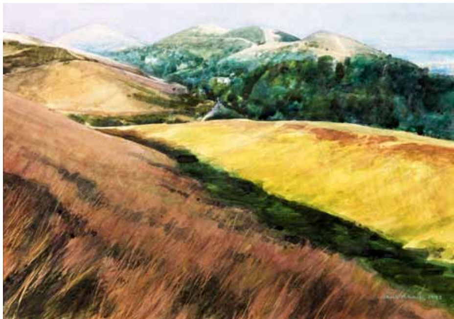
Malvern Hills - 1993 Watercolour, 14 x 19½ in