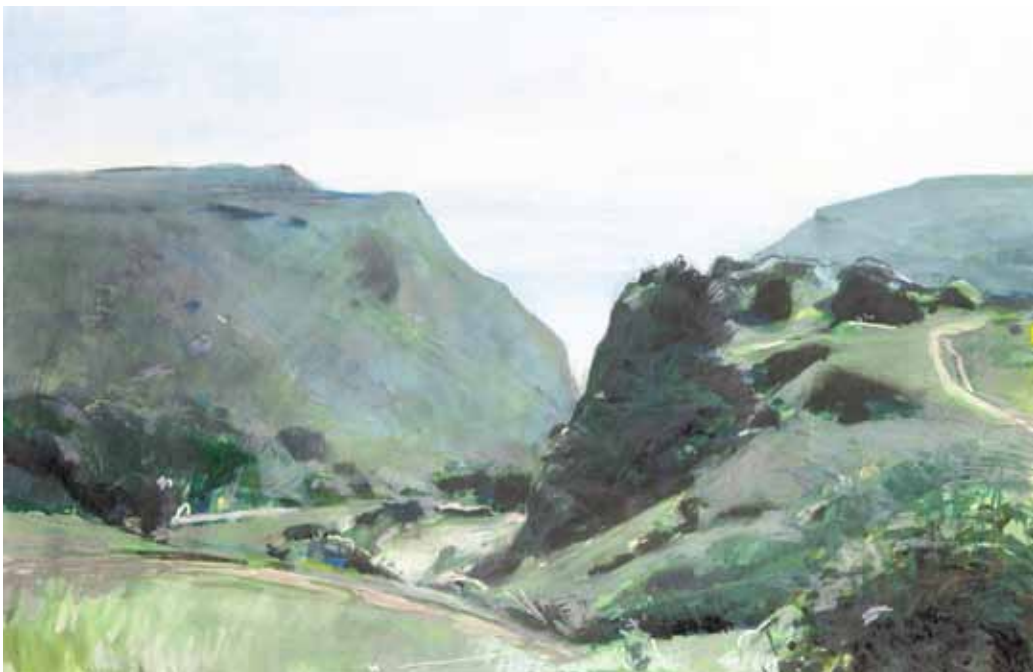
The Gower Pastel and watercolour, 23½ x 35½ in