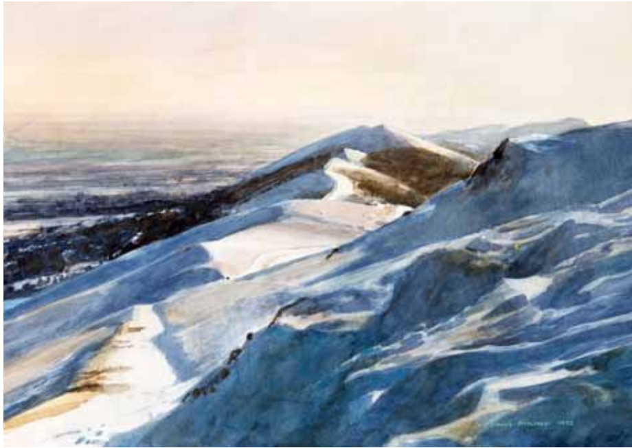
Snow on the Malvern Hills - 1993 Watercolour, 14 x 19½ in