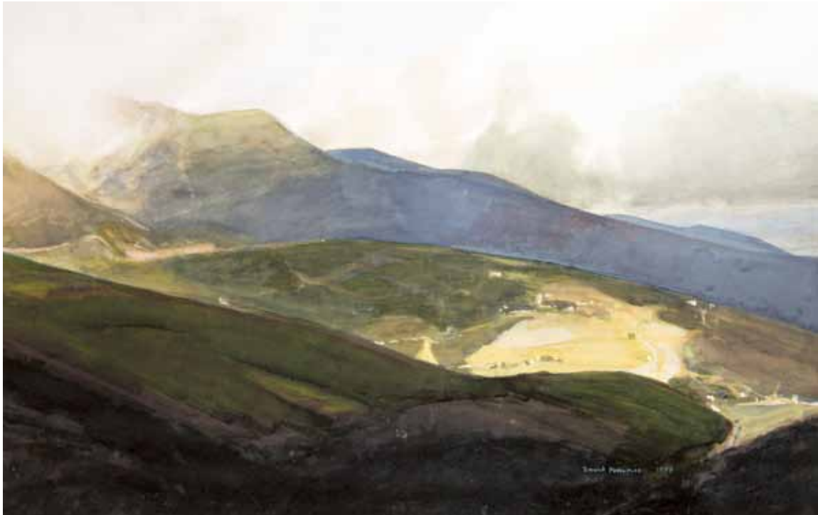
Pyrenees - 1997 Watercolour, 23¼ x 35¾ in