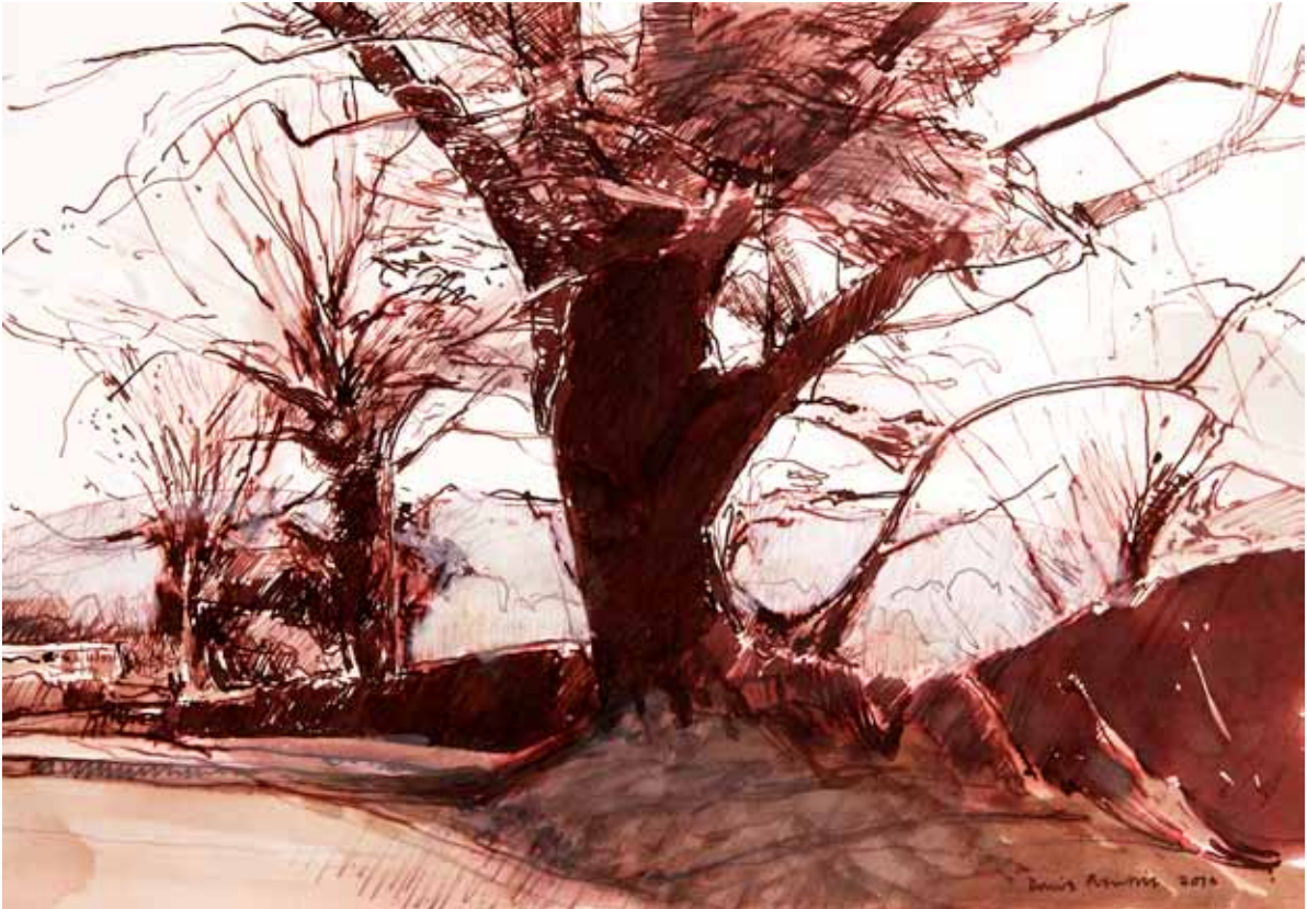
Worcestershire Lane Sketch I - 2010 Pen and ink wash, 13¾ x 19¾ in