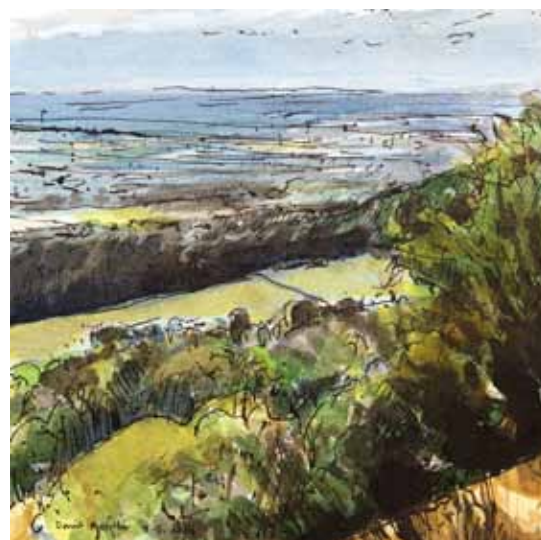
Malvern Hill Sketch II - 09.05.2008 Reed pen and wash, 10¼ x 10¼ in