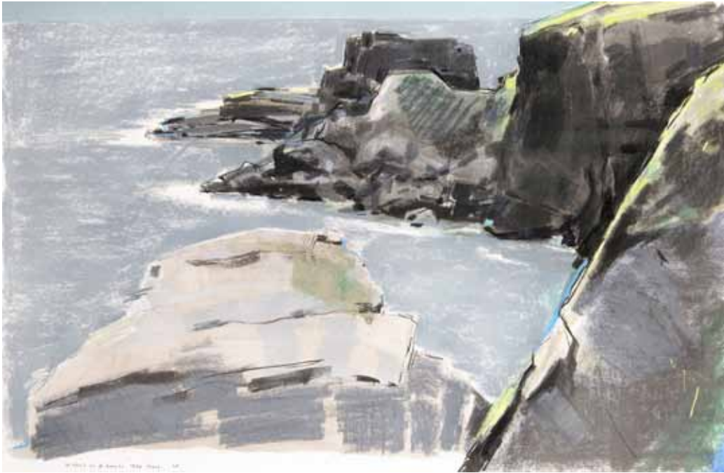
St Non's near St Davids Head, Wales - 1982 Pastel, 23¼ x 35¾ in