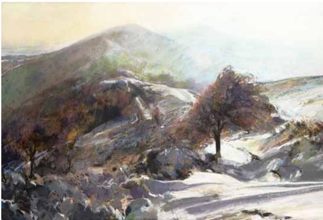
Frost and Snow, Malverns Pastel on watercolour, 23½ x 35¼ in